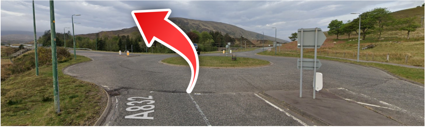
At the Roundabout, take first exit onto A890 (18.0 Miles)