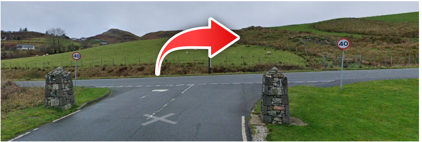
Leaving the Distillery, turn right onto A851 (10.4 Miles)