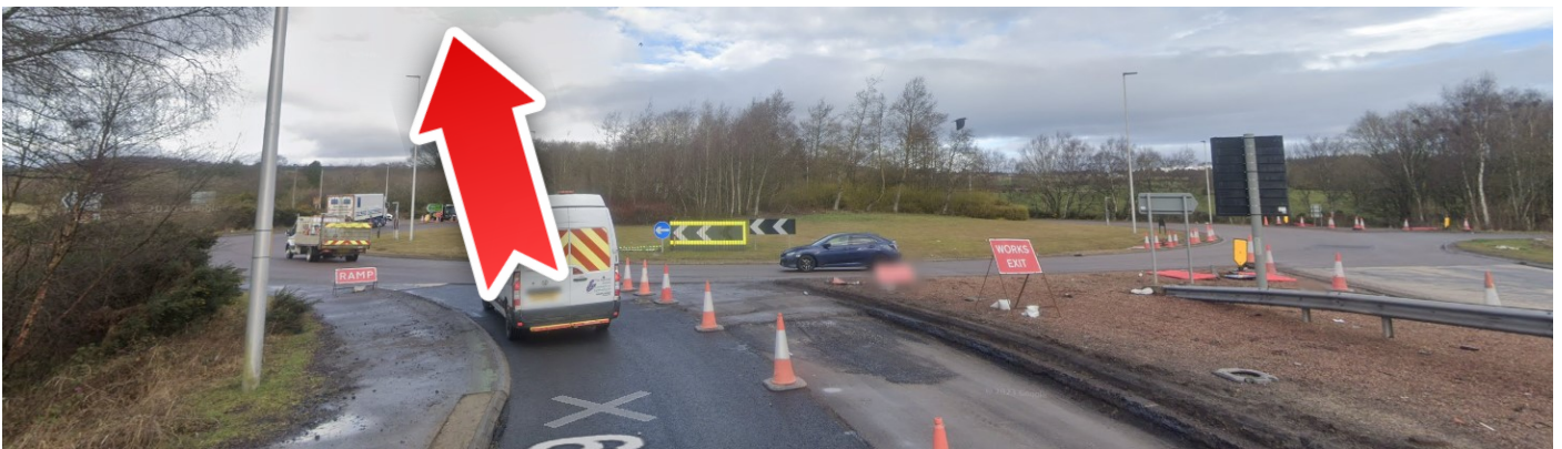
At the next Roundabout, take second exit onto A835 (5.2 Miles)