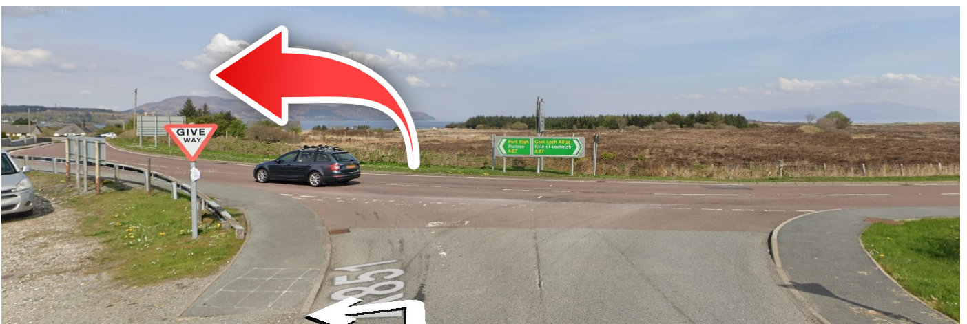
At the Junction, turn left onto A87 (Portree) (17.8 Miles)