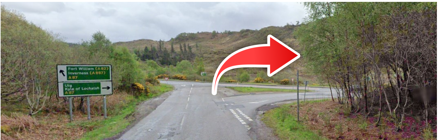
At the Junction, turn right for A87 (Kyle of Lochalsh) (6.6 Miles)