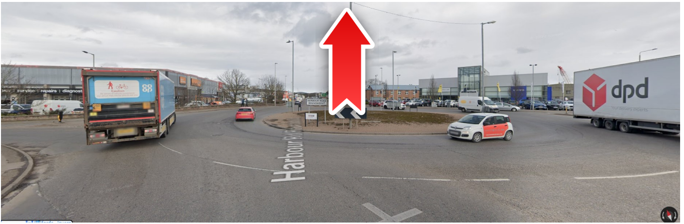
At the Roundabout, take second exit onto A82 (0.5 Miles)