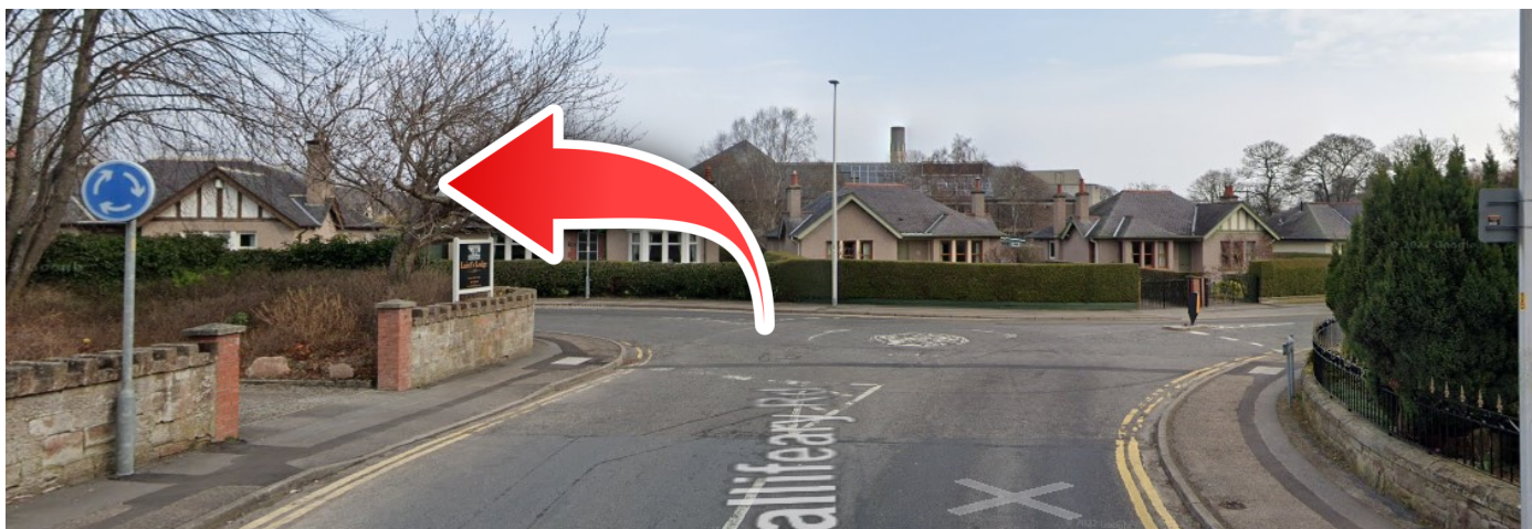
At the Roundabout, take first exit (left) onto Bishops Road (305 ft)