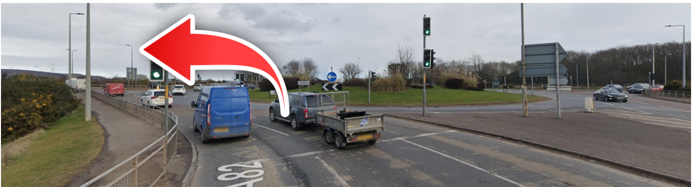
At the next Roundabout, take first exit onto A9 (5.9 Miles)