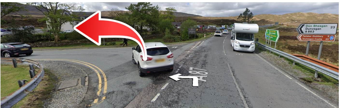
At the Junction, turn right onto A863 (Dunvegan) (21.5 Miles)