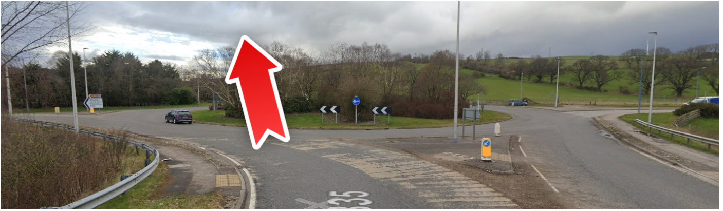
At the Roundabout, take second exit onto A835 (12.7 Miles)