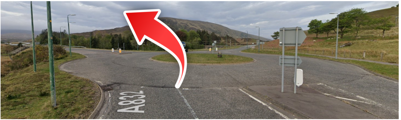
At the Roundabout, take first exit onto A890 (18.0 Miles)