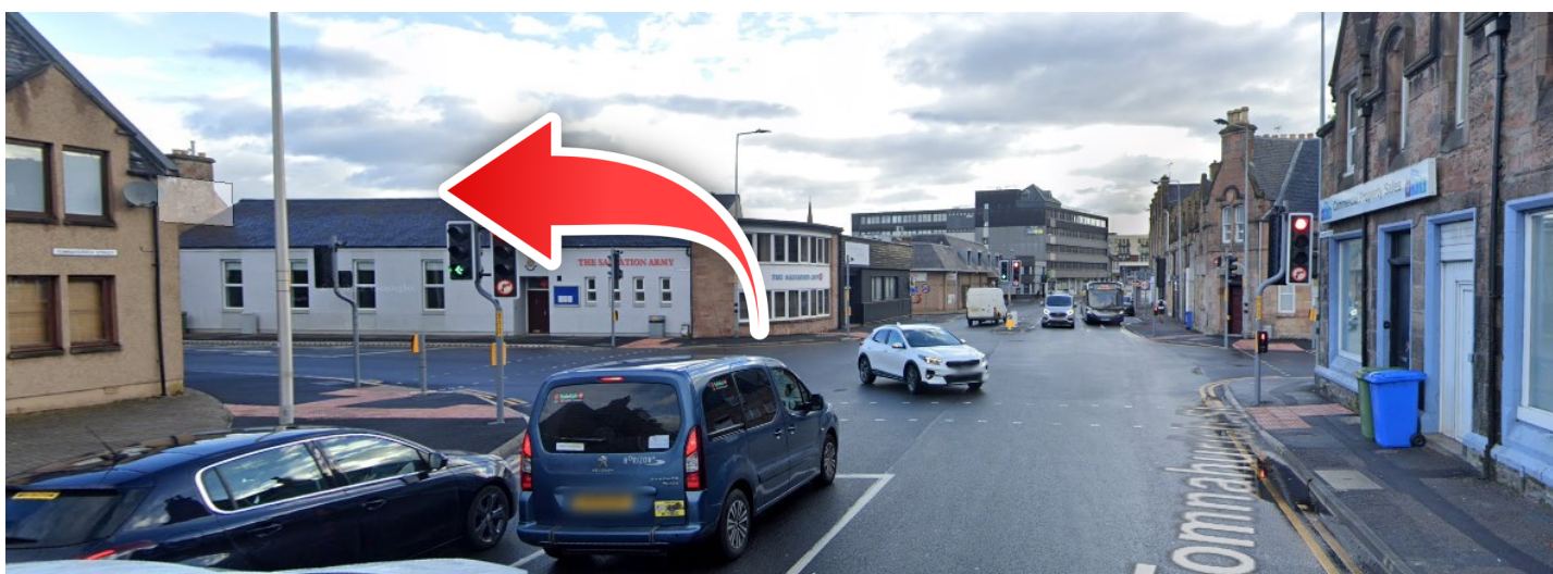
At the traffic lights, turn left onto Kenneth St (A82) (0.4 Miles)