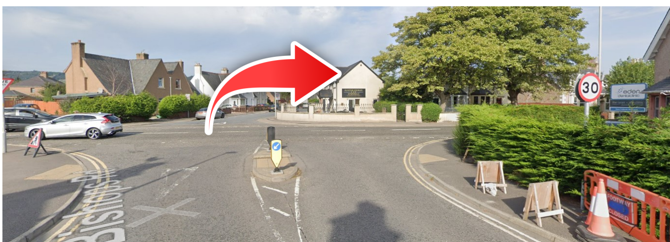
At the junction, turn right onto Glenurquart Road (A82) (0.3 Miles)