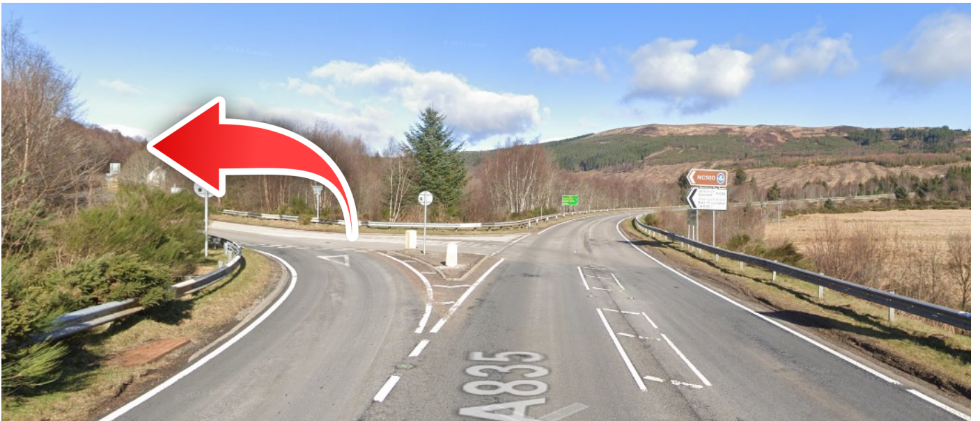
At the junction, take left for A832 (signposted for NC500) (15.5 Miles)