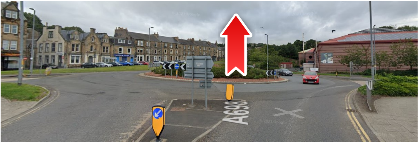
At the next Roundabout, take second exit (straight) onto A7 (0.2 Miles)