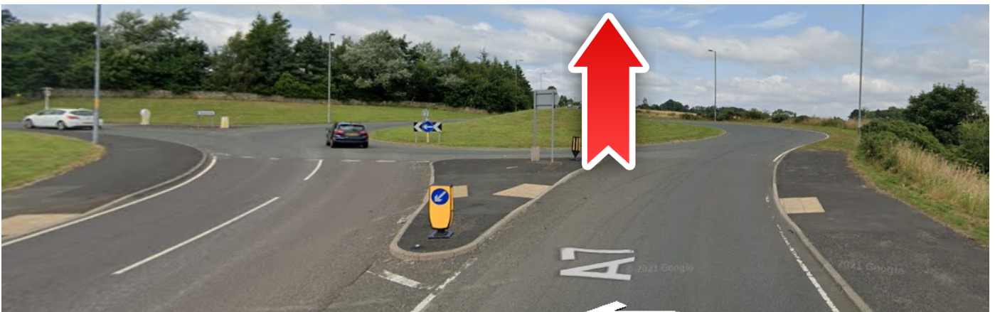
At the next Roundabout, take second exit (straight) to stay on A7 (9.6 Miles)