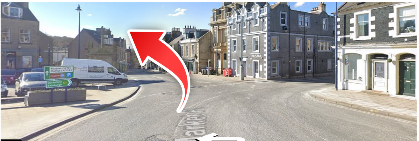
In Selkirk (potential coffee stop if required here) turn left at junction for West Port/A707 (0.7 Miles)